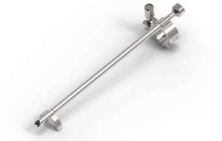
Biopsy needle guides for ALPINION E3-10H probe (Transvaginal type probe)