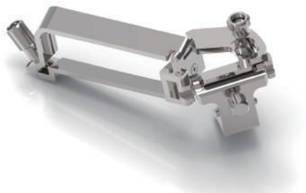
Biopsy needle guides for ALPINION L3-12 probe (Linear type probe)