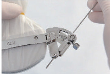
· Needle Insertion