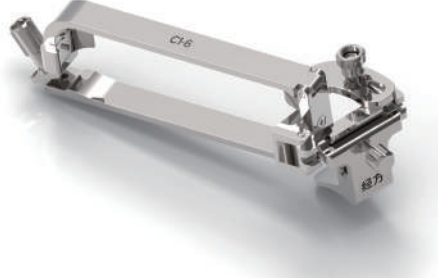
Biopsy needle guides for ALPINION C1-6 probe (Convex type probe)