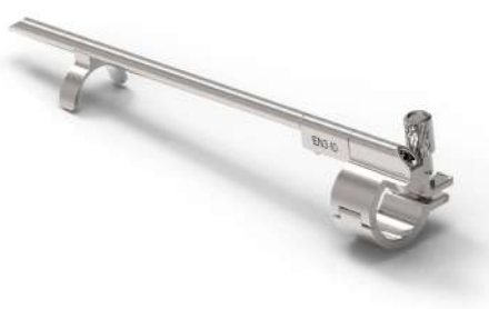
Biopsy needle guides for ALPINION EN3-10 probe (Endocavity type probe)