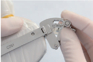
· Angle Adjustment