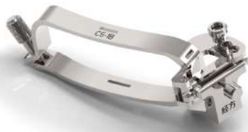
Biopsy needle guides for Wisonic C5-1B probe (Convex type probe)