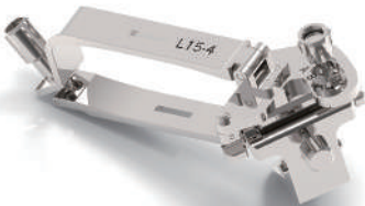
Biopsy needle guides for Wisonic L15-4 probe (Linear type probe)