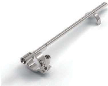
Biopsy needle guides for Wisonic EV10-4 probe (Endocavity type probe)