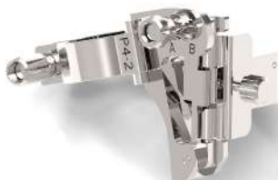
Biopsy needle guides for Wisonic S4-2 probe (Phased Array type probe)