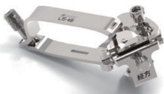
Biopsy needle guides for Wisonic L15-4B probe (Linear type probe)