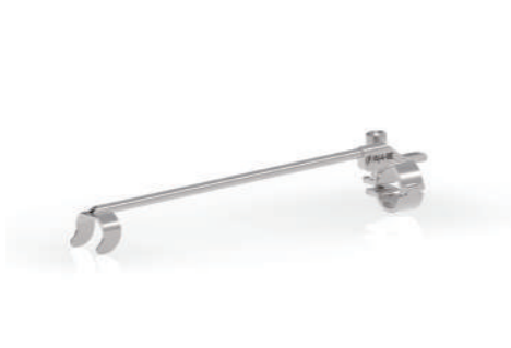
Biopsy needle guides for Vinno F4-9E probe (Endocavity type probe)