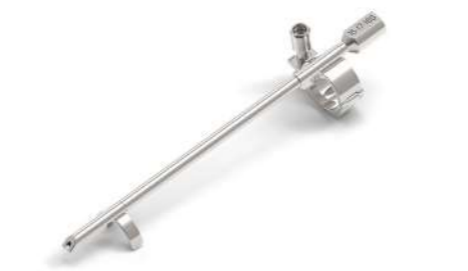
Biopsy needle guides for Vinno G4-9E probe (Endocavity type probe)