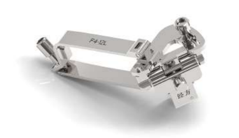
Biopsy needle guides for Vinno F4-12L probe (Linear type probe)