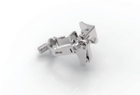
Biopsy needle guides for Vinno G3-8M probe (Microconvex type probe)