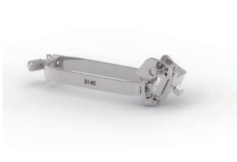
Biopsy needle guides for Vinno S1-8C probe (Convex type probe)