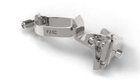
Biopsy needle guides for Vinno F2-5C probe (Convex type probe)