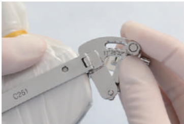
· Angle Adjustment