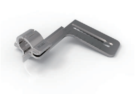
Biopsy needle guides for Esaote TRT33 probe (Transperineal type probe)