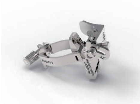
Biopsy needle guides for Esaote P1-5 probe (Phased array type probe)