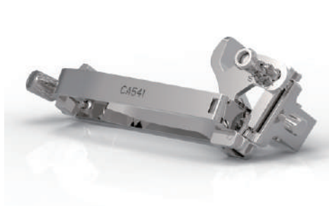
Biopsy needle guides for Esaote CA541 probe (Convex type probe)