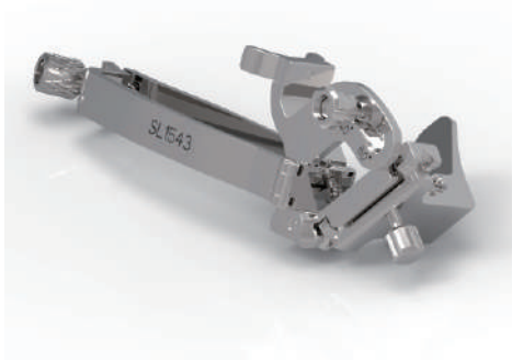
Biopsy needle guides for Esaote SL1543 probe (Linear type probe)