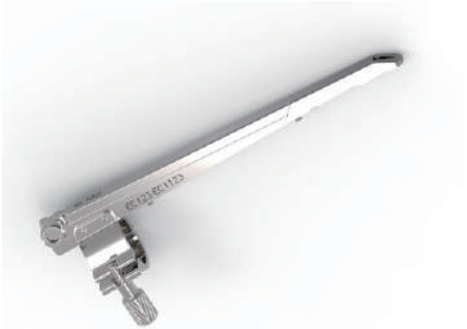
Biopsy needle guides for Esaote EC123 probe (Endocavity type probe)